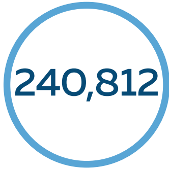
Number of Clinical Visits (BRMG)