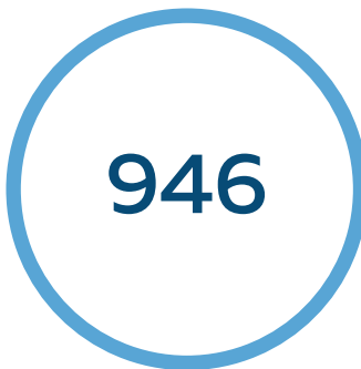
Number of Deliveries