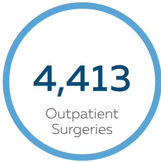
Number of Surgeries Performed