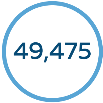
Number of Emergency Department Visits